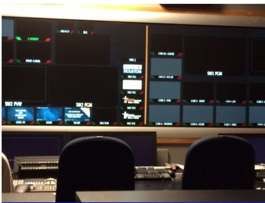
A glimpse of the huge main control room that houses rows of engineers monitoring multiple angles throughout the huge complex

Sunday February 5th 2017 the stadium floor shown above hosted the New England Patriots and the Atlanta Falcons in Super Bowl LI. On Monday February 6th the stadium riggers were already assembling the monstrosity shown above. The centerpiece that would augment the world's most popular artists on a huge rotating stage in front of up to 75,000 rodeo fans at the world's largest rodeo, The Houston Livestock and Rodeo Show™. So what's the audio/visual backbone that supports not only the stadium pictured above but the huge exhibit halls adjacent to the show area?